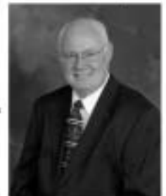
Access to Opportunities